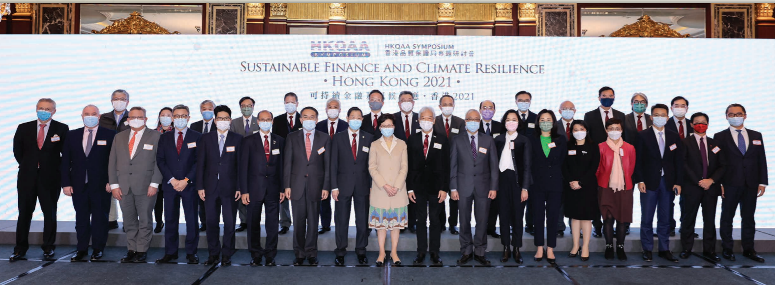
Group photo with HKQAA Governing Council members, Green and Sustainable Finance Certification Scheme Technical Committee Members, guest speakers, and leaders from government departments, regulatory organisations and others renowned organisations in the financial sector, including: