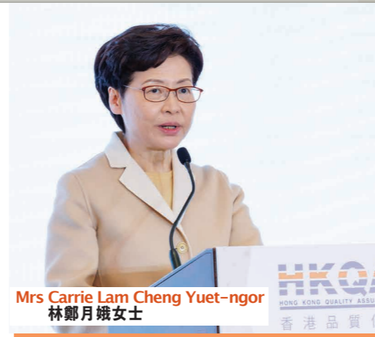
Mrs Carrie Lam Cheng Yuet-ngor 林鄭月娥女士

The Chief Executive of the Hong Kong Special Administrative Region 香港特別行政區行政長官