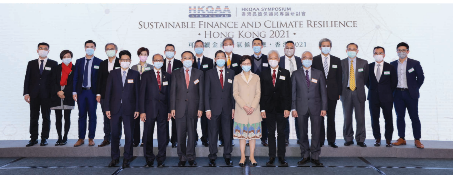
Group photo with leaders and representatives of Green and Sustainable Finance Issuers in the public utilities, industrial and commercial sectors, including: