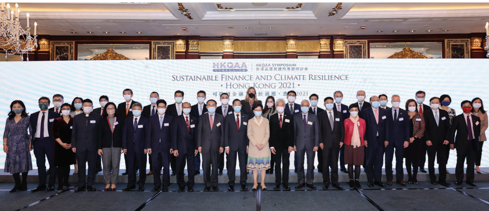
Group photo with leaders and representatives from the banking and financial institutions, including: